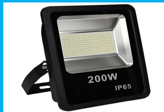
LED Flood Light-5054: 10w to 400 w